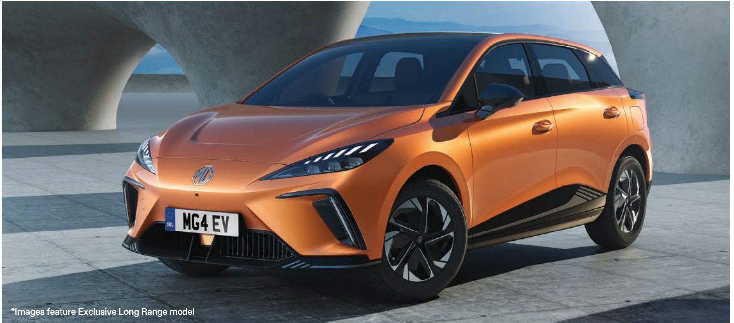
*Images feature Exclusive Long Range model