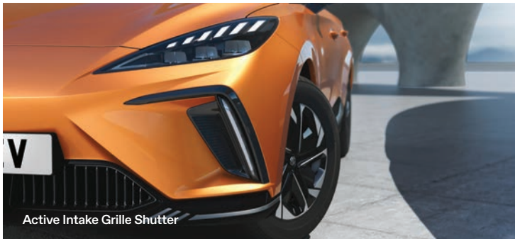
Active Intake Grille Shutter