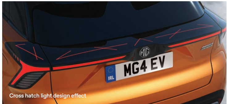
Cross hatch light design effect