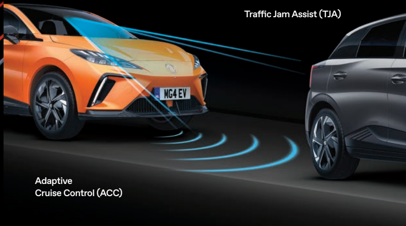
Adaptive Cruise Control (ACC)

The MG Pilot suite of high-tech driver assistance technology gives you added confidence on the road. A selection of warning and alert features assists the driver, maintaining safety and simplifying everyday driving.