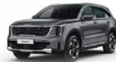
Steel Grey (KLG)