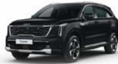
Aurora Black Pearl (ABP)