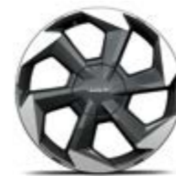
19" alloy wheels