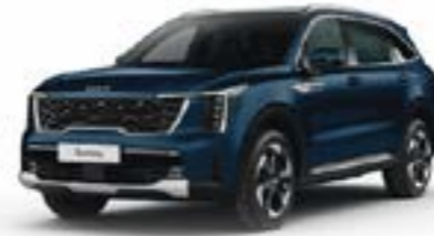
Gravity Blue (B4U)