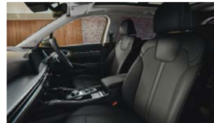
Black Vegan Leather