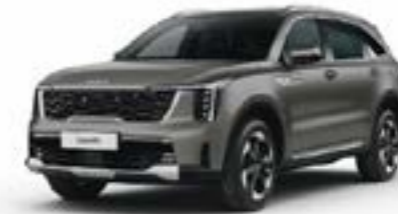
Volcanic Sand (BN4)