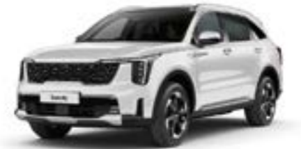
Snow White Pearl (SWP)