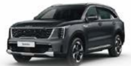
Interstellar Grey (AGT)