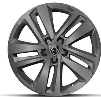
17" Alloy Wheels ZHJZ - €1,125