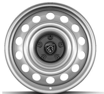
16/17" Steel Wheels Standard