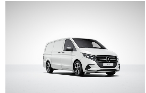
Rock crystal white metallic