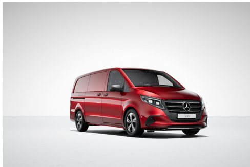
Hyacinth red metallic