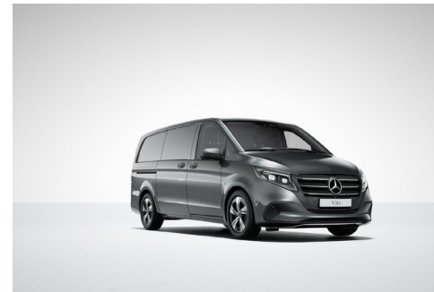
Graphite grey metallic