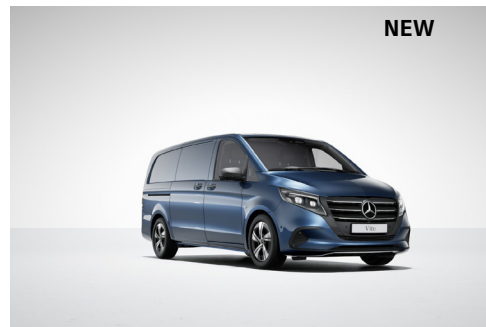
Sodalite blue metallic