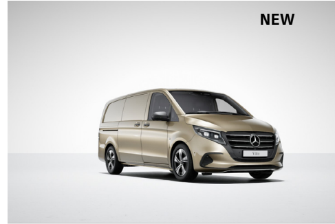
Kalahari gold metallic