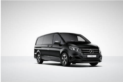
Obsidian black metallic