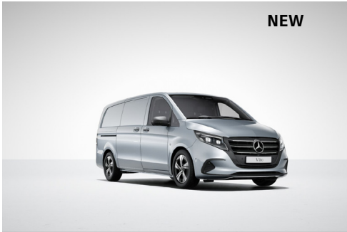
High-tech silver metallic