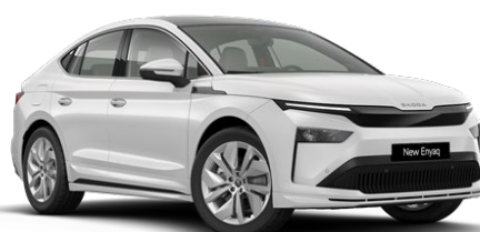
Moon White (2Y2Y - Metallic)