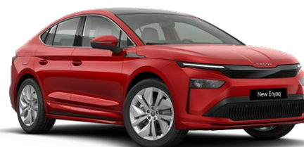
Velvet Red (K1K1 - Exclusive)