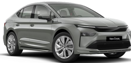
Steel Gray (M3M3 - Solid)