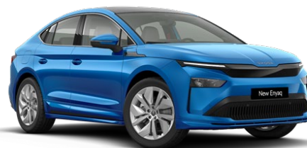
Race Blue (8X8X - Metallic)