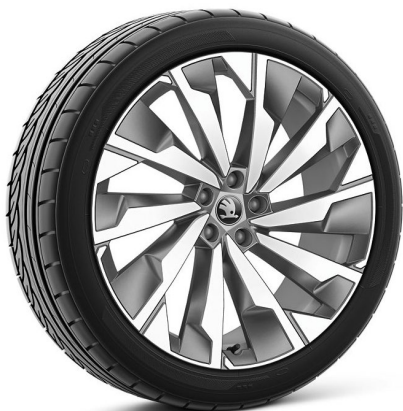
21" 'Supernova' anthracite alloy wheels (Code PJG/PJH)