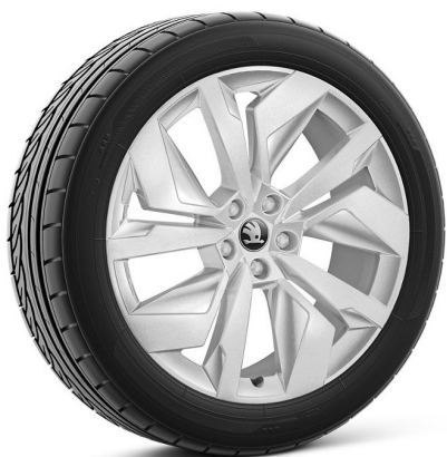
20" 'Vega' silver alloy wheels (Code U20/65R)