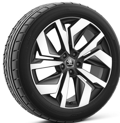
20" 'Vega' anthracite alloy wheels (Code CB2)