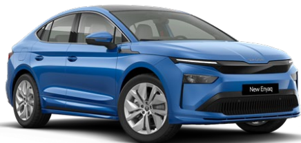
Energy Blue (K4K4 - Solid)