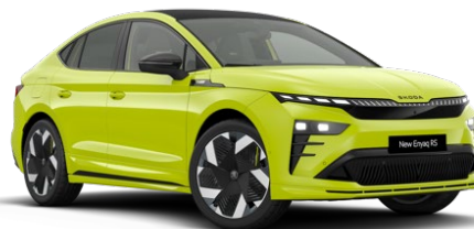
Mamba Green I3I3 - Solid)