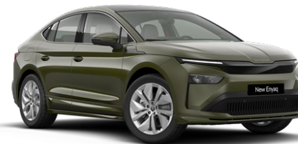
Olibo Green (R2R2 - Exclusive)