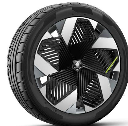
21" 'Vision' alloy wheels (Code 65Z)