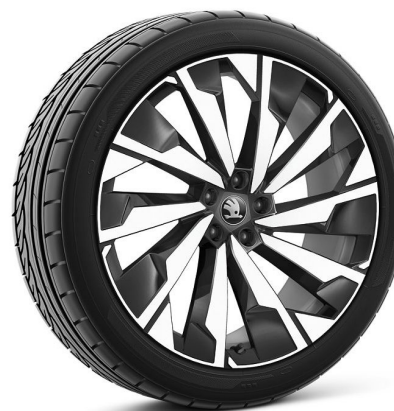
21" 'Supernova' black alloy wheels (Code PJJ/PJM)