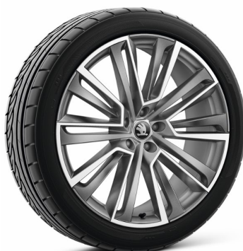
21" 'Aquarius' anthracite alloy wheels (Code C5W)