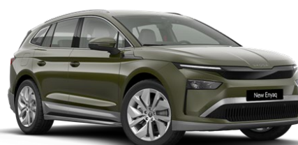
Olibo Green (R2R2 – Exclusive)