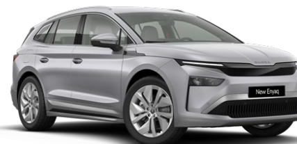
Smokey Diamond Silver (B3B3 – Metallic)