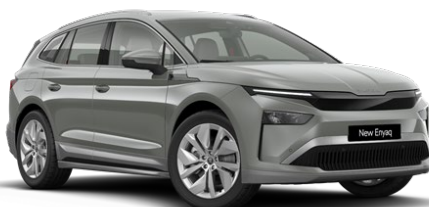
Steel Grey (M3M3 – Solid)