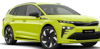
Mamba Green (I3I3 – Solid)*