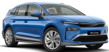
Energy Blue (K4K4 – Solid)