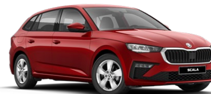
Velvet Red (K1K1 - Exclusive)