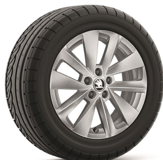
16" Cortadero Aero alloy wheels (Code P02)