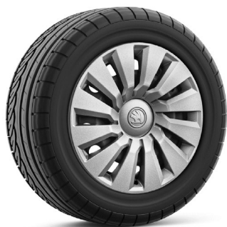
16" Tecton steel wheels (Code CY0)