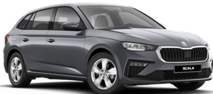
Graphite Grey (5X5X - Metallic)