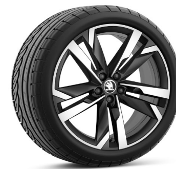
18" Ursa black & diamond cut alloy wheels (Code PJI)