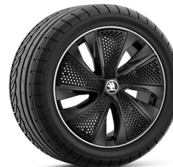
17" Kajam alloy wheel with aero cover (Code 41B)