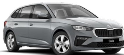
Smokey Diamond Silver (B3B3 - Metallic)