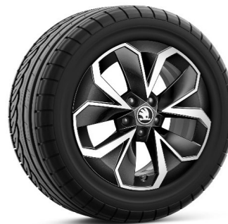
16" Montado Aero alloy wheels (Code P08)