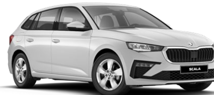
Moon White (2Y2Y - Metallic)