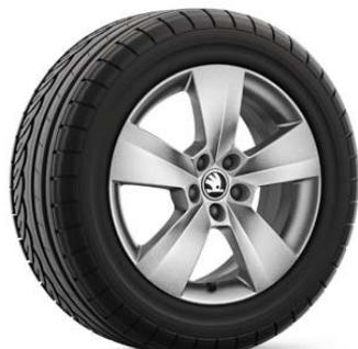
16" Nyota alloy wheels (Code CF1)