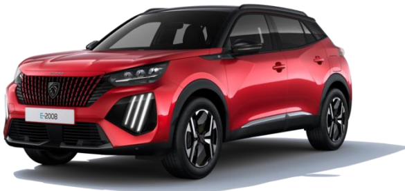
Elixir Red M5VH - Optional