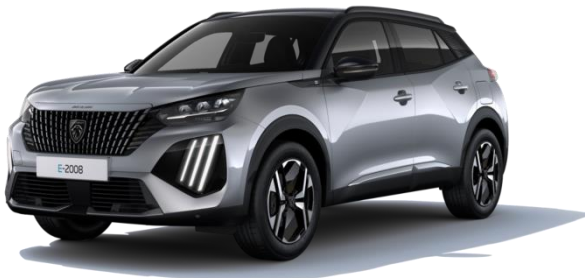
Cumulus Grey M0F4 - Optional