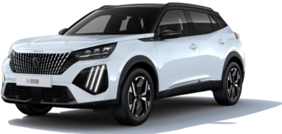
Okenite White M0SU - Optional