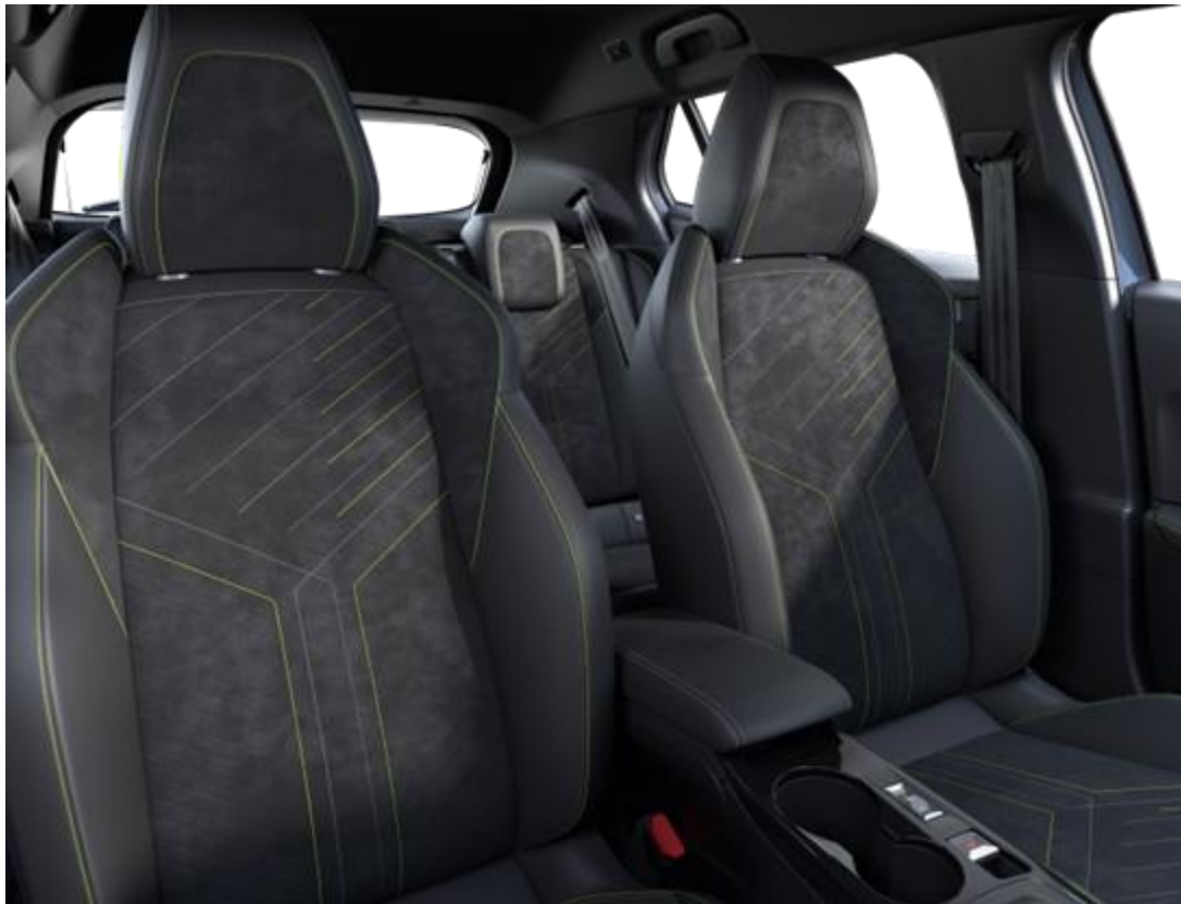
Alcantara® Mistral ICONIUM upholstery with TEP Isabella support, Black Alcantara trim and Adamite Green stitching