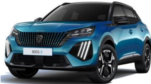
Obsession Blue M0DP - Optional