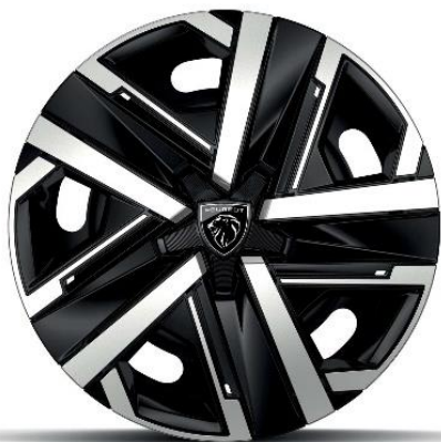
16" 'SILOM' wheel trims

Gloss Grey & Black Orbital, matt varnish