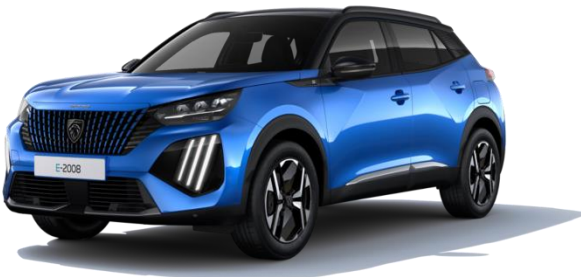
Vertigo Blue (Stock Only) M6SM - Optional