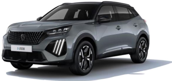
Selenium Grey M0LD - Free paint