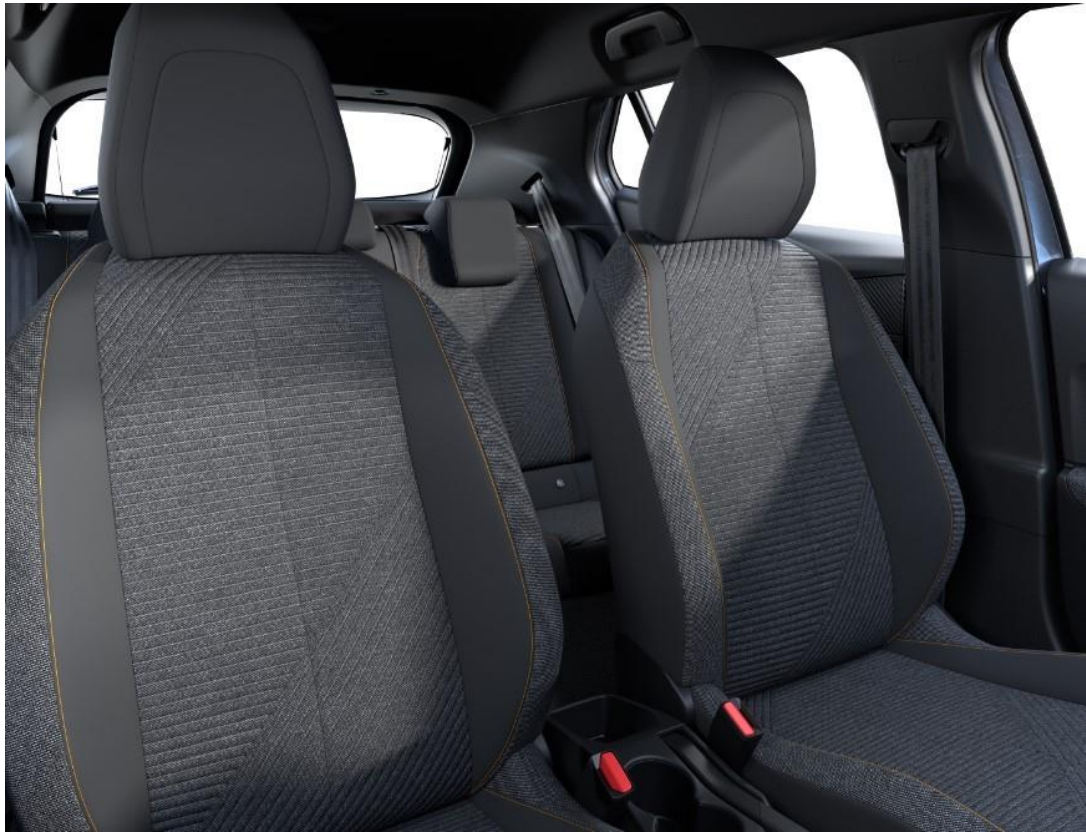
Tri-material 'Casual Lomsa' embossed fabric, leather effect and cloth seat trim with Quartz stitch detail