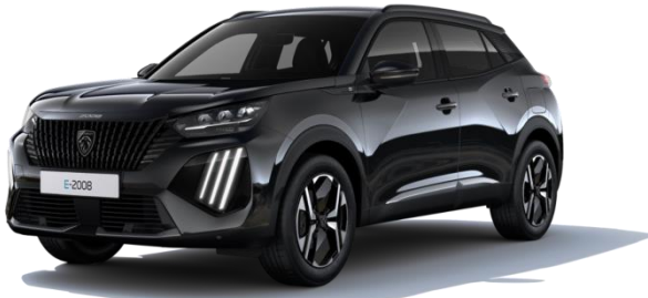
Nera Black M09V - Optional