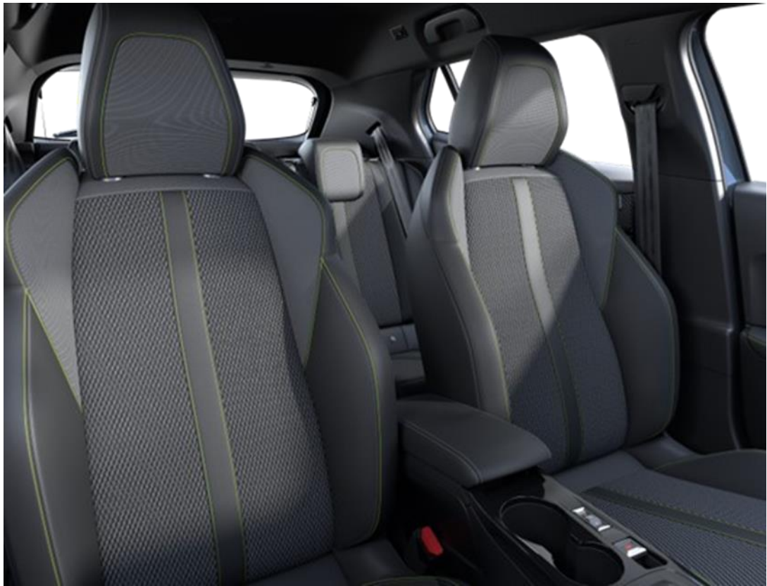
Tri-material 'CAPY' leather effect and 'BELOMKA' cloth seat trim with Adamite stitch detail