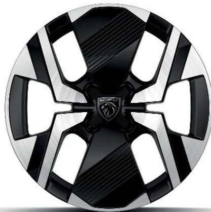
17" 'KARAKOY' diamond cut alloy wheels

Dual-Tone Orbital Black and gloss varnish